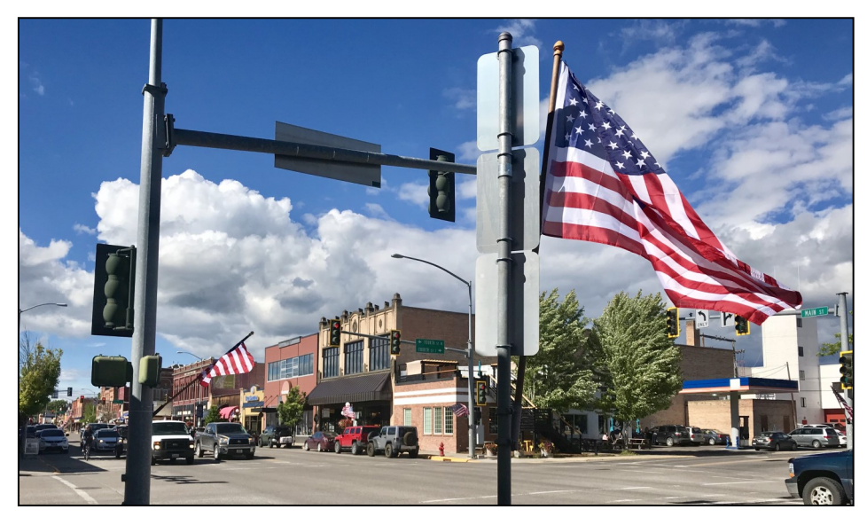
4th and Main, Downtown Kalispell

Dogs must be kept on a leash no longer than 6 feet in length when out and about in the city. Vicious dogs are not allowed in the city limits, and it is unlawful to have more than four dogs. Please refer to Kalispell's City Codes for the rights and responsibilities of pet owners including what animals are not allowed to reside in City limits. City Codes can be located on the city's homepage under Government, City Codes.