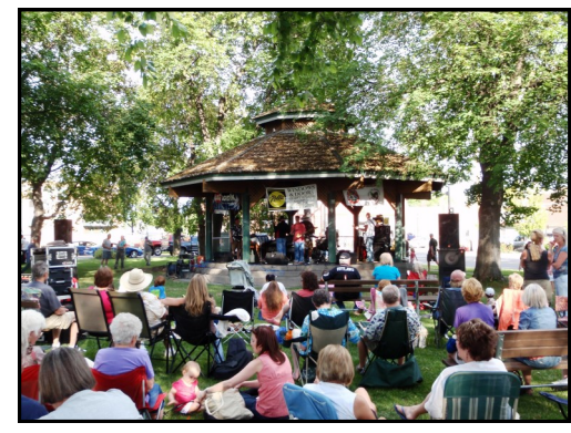
Picnic In The Park Concert Series