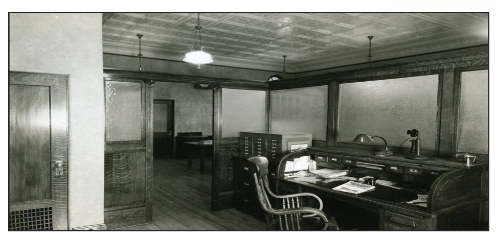
Prior Water Dept. at 312 First Avenue East, now Public Safety