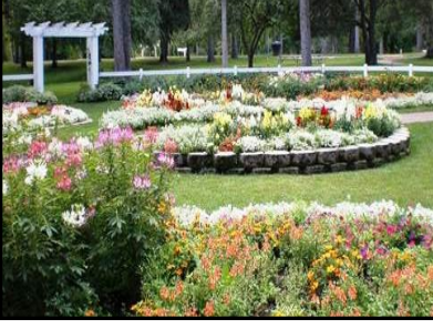
Formal Garden in Woodland Park

Kalispell Parks & Recreation maintains 419 acres of parkland and natural open space including over 28 city parks that include many pavilions, gardens, & green spaces for hosting group events. An interactive map of parks and trails that lists amenities is available at <a href="https://www.kalispell.com">www.kalispell.com</a> under Departments - Parks. For activities such as family gatherings, company picnics, sports