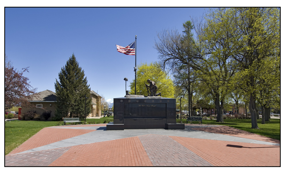
Veteran's Memorial at Depot Park

Learn more about working for the City of Kalispell and check for available positions on the city website under Human Resources. You can also sign up for job posting notifications at <a href="https://www.kalispell.com">www.kalispell.com</a>, Notify Me on the home page.